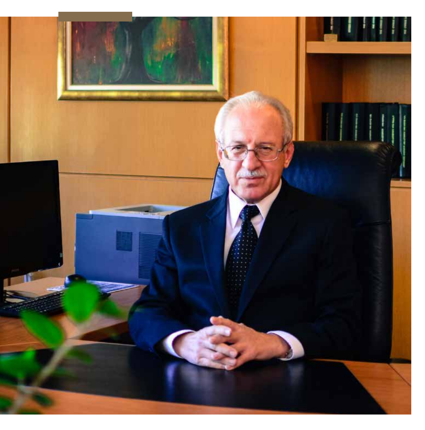
ABOVE: Yiasemis N. Yiasemis, Justice, President of the Committee of the Civil Procedure Rules of Cyprus